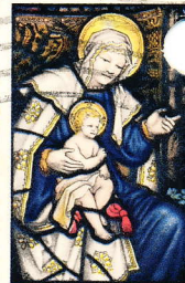
Christmas USA 15c