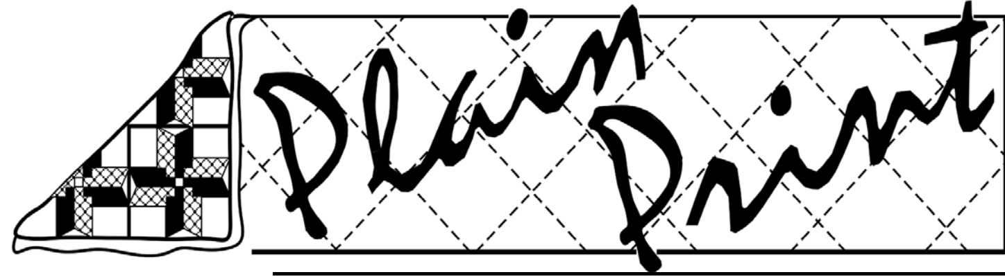
Volume 40, Number 1