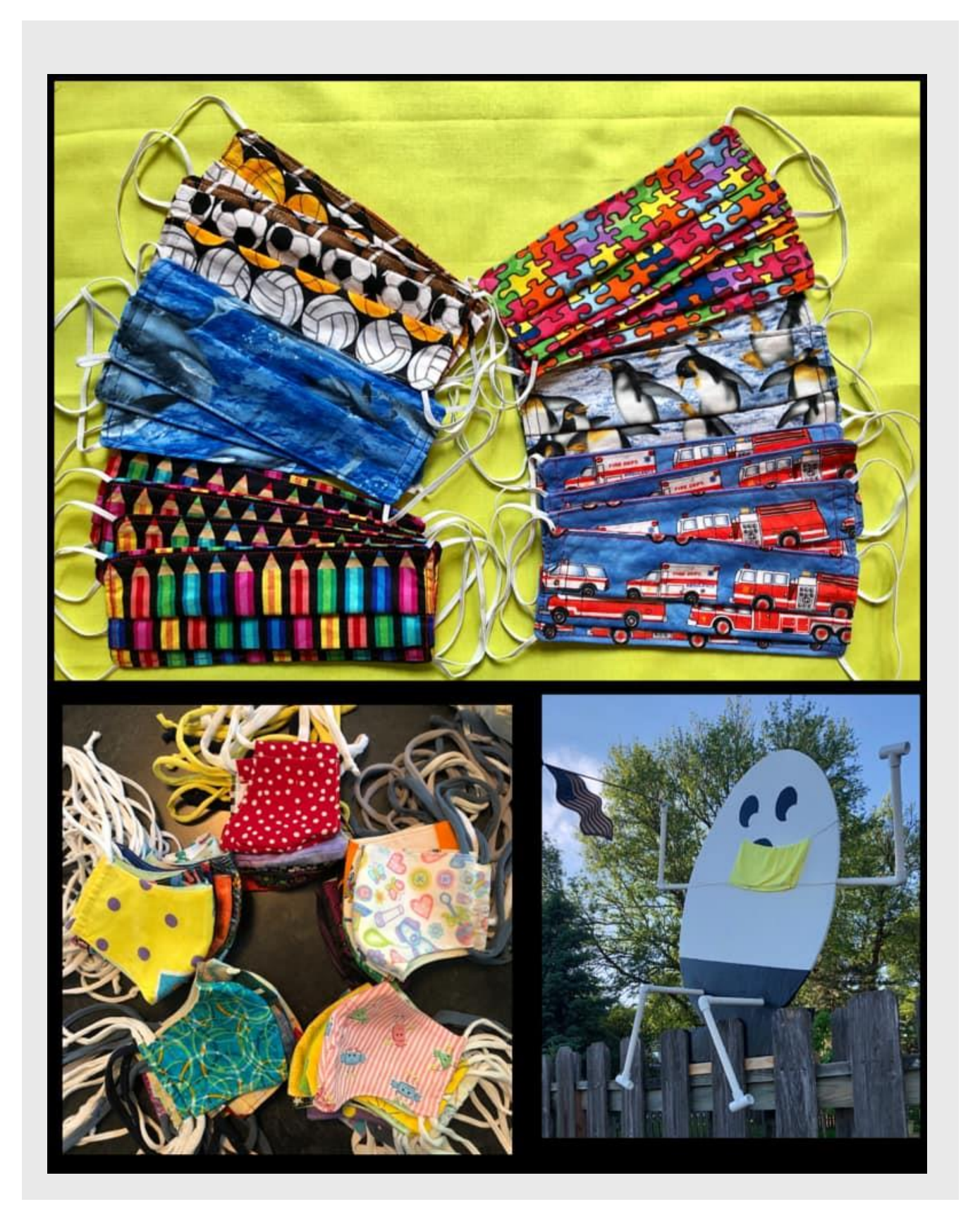
The Lincoln Quilters Guild Board is meeting again in a few days. We will provide you with information as soon as we can about future Guild meetings and workshops as we review the